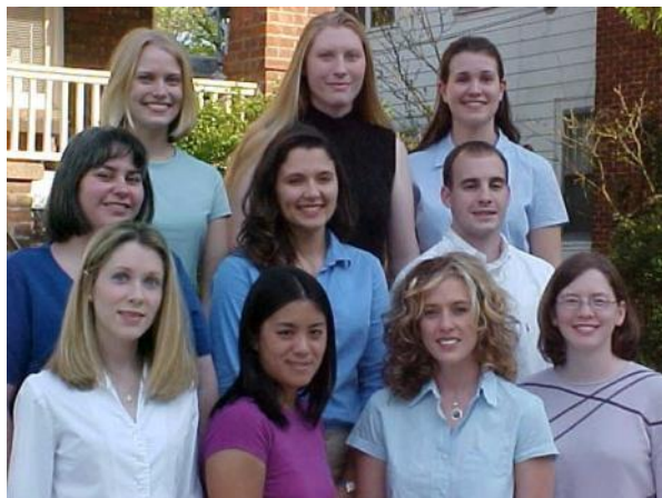
Class of 2003