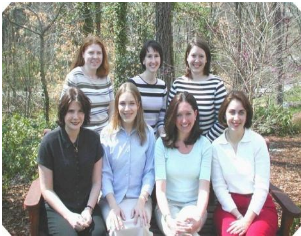
Class of 2002