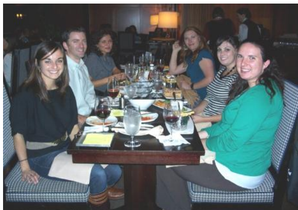
Having fun at the alumni reunion!