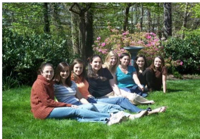
Class of 2008