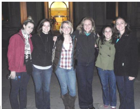
Current second year students on a haunted ghost tour of historic Boston.