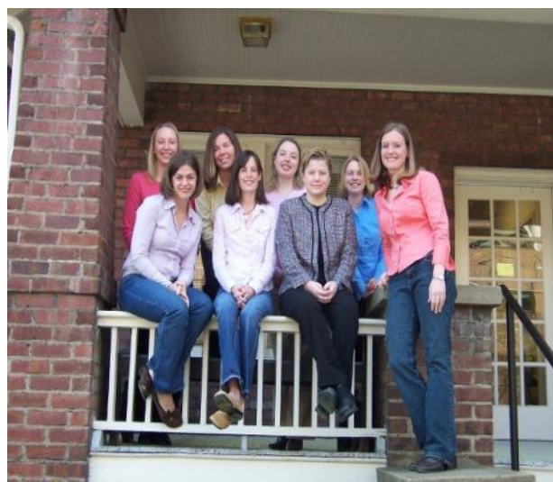
Class of 2005