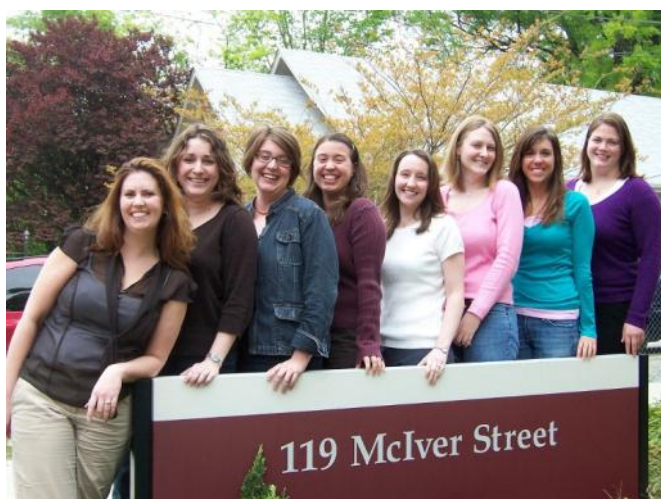
Class of 2007