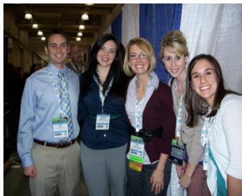
Current students and recent grads at poster presentations.