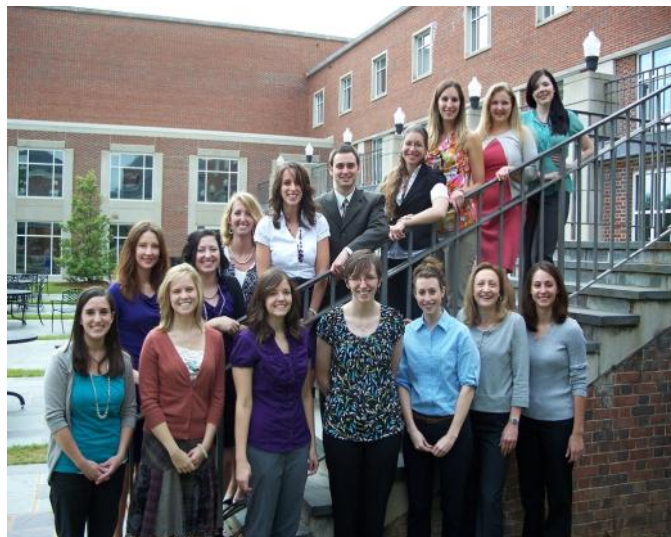
First and second year students enjoying time together before graduation.