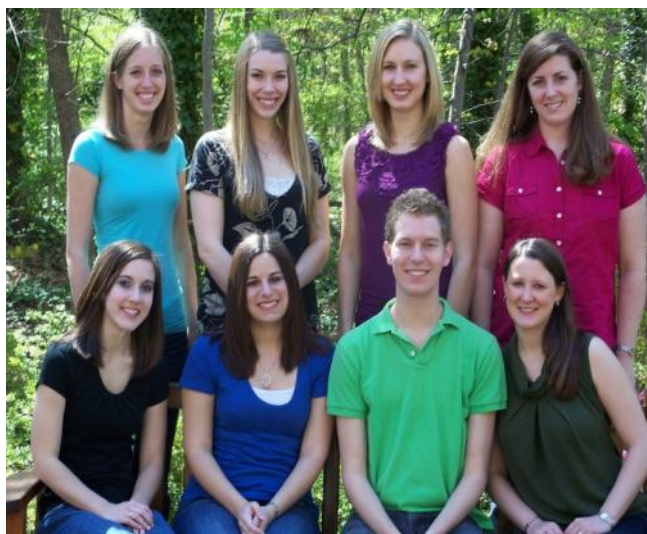
Class of 2011