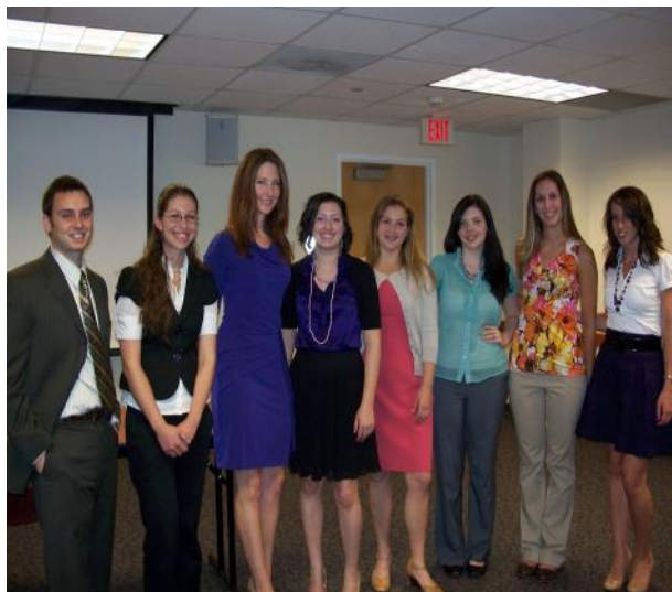
The Class of 2012 celebrates on Capstone day!