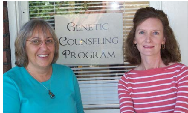
Our new sign— a gift from the class of 2010

The program continues to attract a large number of qualified applicants, a growing number of whom tell us of contacts they have had with program alumni through shadowing or internship experiences.