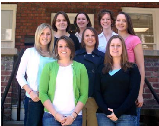
Class of 2009