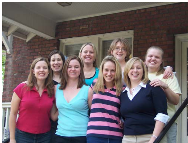
Class of 2006