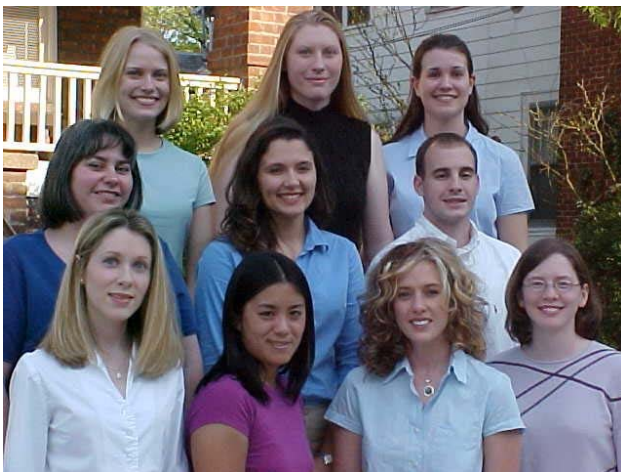
Class of 2003