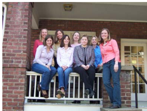
Class of 2005