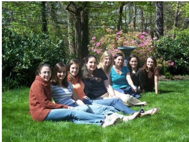
Class of 2008