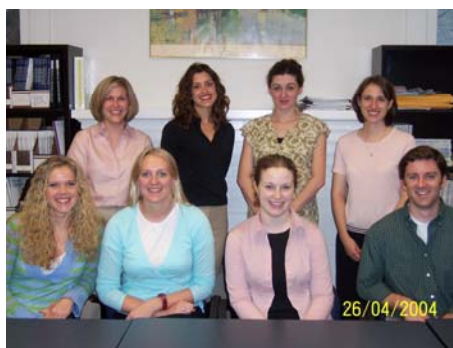
Class of 2004